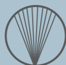
HIGH PRESSURE OPTIONS