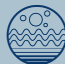
PARTICULATE AND WATER AS PPM + DENSITY