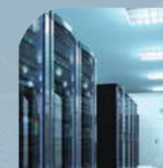
DATA CENTRE FUEL TESTING