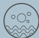
PARTICULATE AND WATER AS %RH