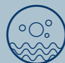
PARTICULATE AND WATER AS PPM