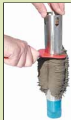
Cleaning the core